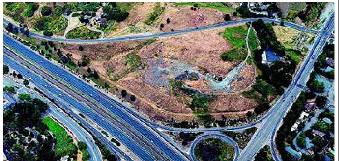
Aerial view of the Deer Hill Road development site.